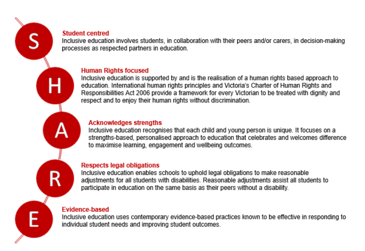
Figure 1. The Department of Education and Training's SHARE Principles of Inclusive Education.

The services provided by the Vision Technology Library align with the Department's SHARE Principles of Inclusive Education. It provides schools with specialised resources so that they can meet the unique requirements of their students in line with these principles.